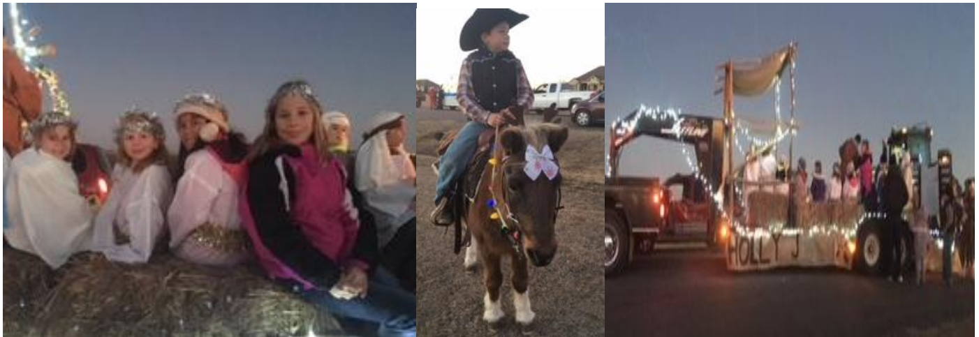
To celebrate Christmas the Ninnescah 4-H Club had a live nativity float with their 4-H animals in the Pretty Prairie parade. The club also adopted a family for Christmas. Way to show the holiday spirit and get the word out about 4-H and all the amazing things you do.