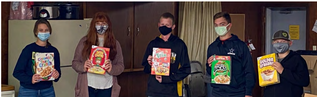
It was a covid safe installation of officers at 4-H council!