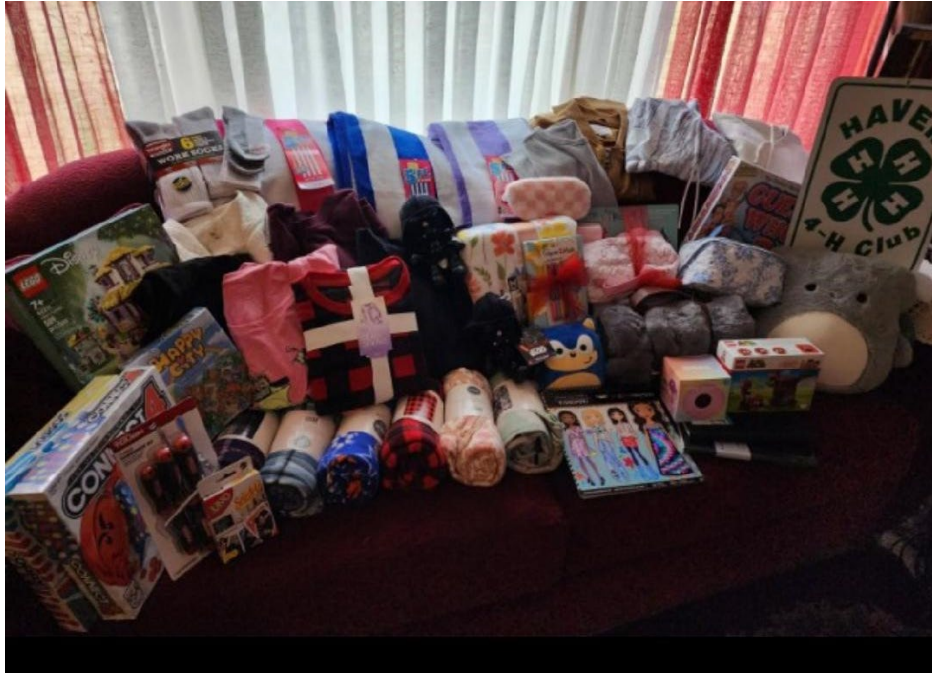
Haven 4-H Club's donations for First Call for Help Teen Christmas and Haven Food Bank.

At the meeting, Haven 4-H Club members and their families brought unwrapped gifts to donate to First Call for Help Teen Christmas, a program that helps teenage boys and girls in Reno County. Members and families also donated food items to support the Haven Food Bank. In addition, the Haven 4-H Club made monetary donations to both Teen Christmas and the Haven Food Bank.