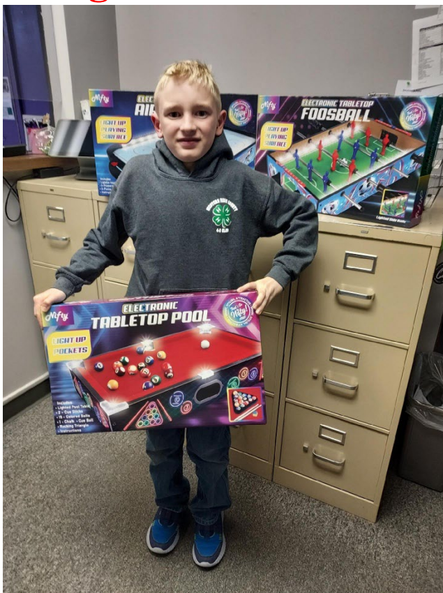
Top Seller Case Nickels Western Reno County

Congratulations to our top 5 cookie dough sellers