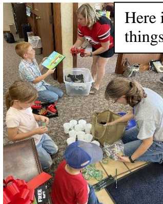
Here is a picture of people helping getting things ready