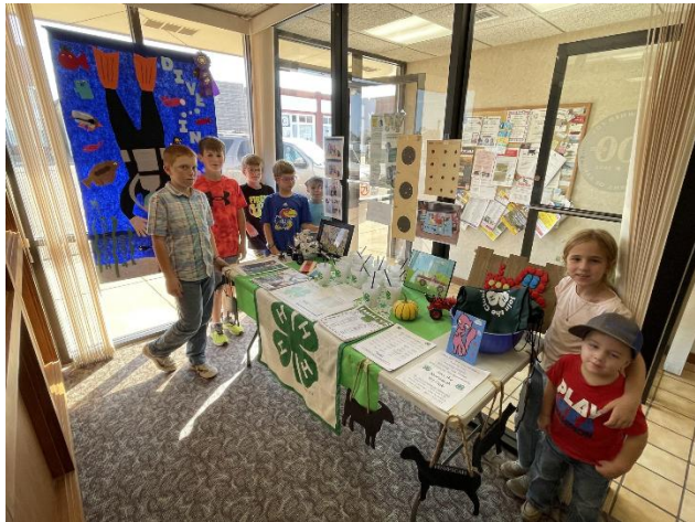
This is the picture of our display.

We also set out our club banner and some coloring sheets about 4-H. So people can see what 4-H is about and maybe come and join 4-H.