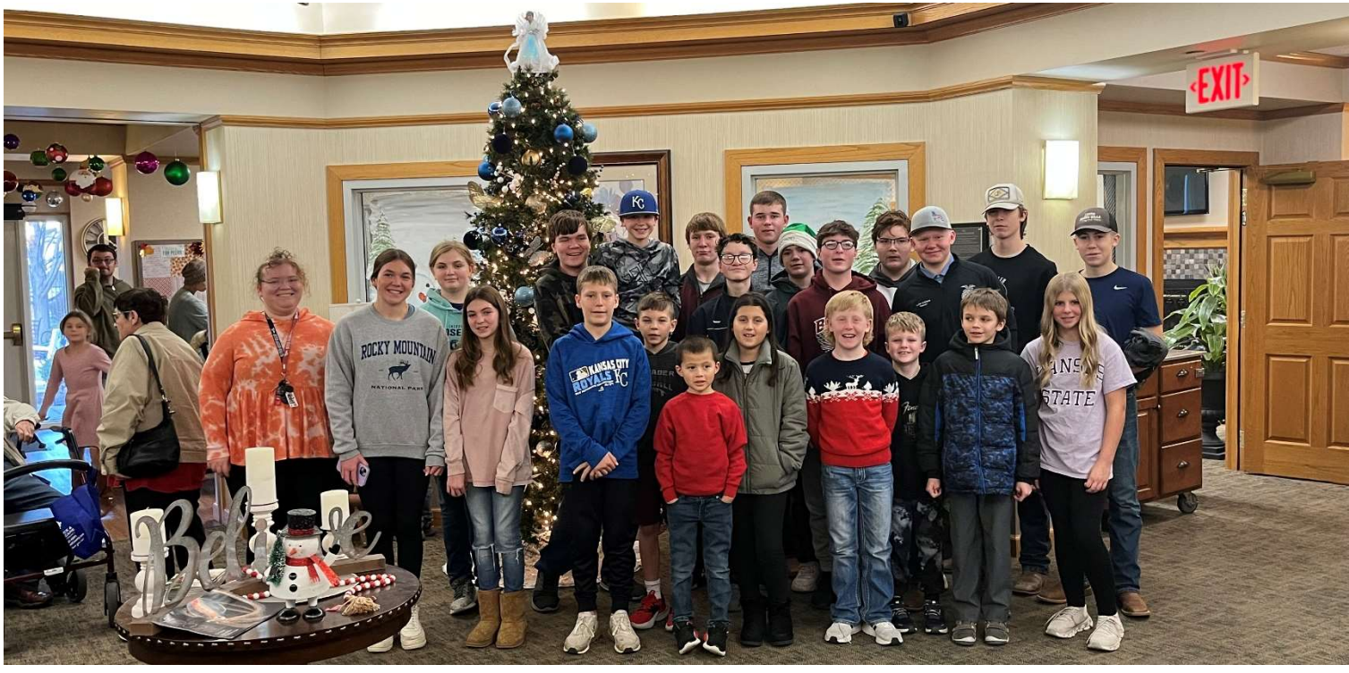
Union Valley Christmas Caroling in 2015 How fun is this comparison.