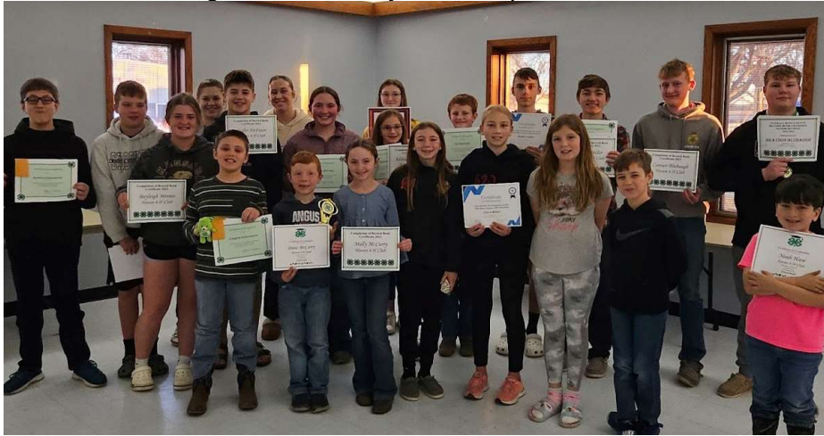
Haven 4-H Members with their County Awards!