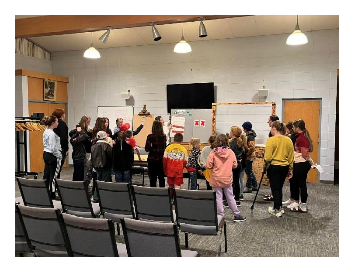
Christmas Party fun and games!