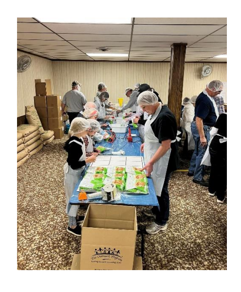
Thomadora Club members helping package 50,000 meals.