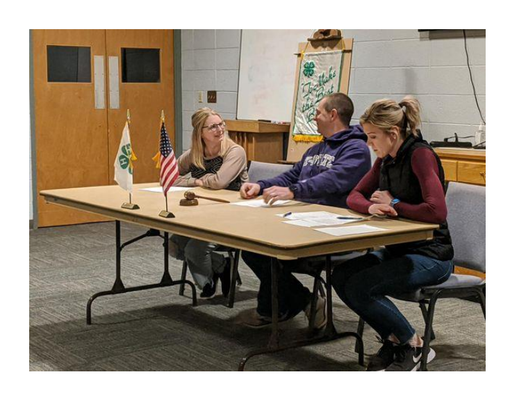
January meeting led by parent volunteers!