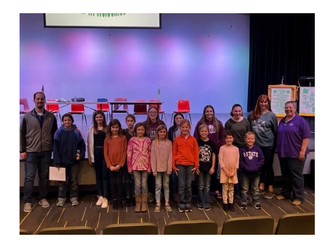
Thomadora Club members at Achievement Day.