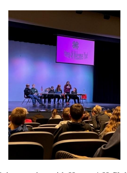
Joint meeting with Haven 4-H Club.